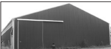
#10075980 Over 7 acres of beautiful property with 60 x 100 barn and riding ring for horses. 3 beautiful home sites in upscale area. Do not let this great opportunity pass you by. Priced at $109,000