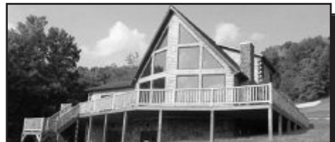
#74064 - This Unique Beautiful Home Has Everything You Could Want. Nestled In A Pristine Setting With A Beautiful Scenic View Of The Lake. Open Floor Plan With Woodfloors, Fireplace, Family Room And 4 Bedrooms, Ready For A Family! $449,000