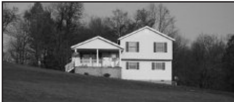
#75921 - 22 Miles from Buckhannon. Great property in the country featuring '98 home with 12 rooms located on 3.77 acres! Adjoining additional 41 acres +/- can be a cozy rental or guest house with some TLC.