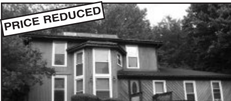
#74786 - Unique home has it all! Privacy w/river views with hot tub in city limits. Open floor plan w/sky light, hardwood floors, stainless steel appliances. 3 large bedrooms and 2 full baths. Do not let this opportunity pass you by. Priced at $144,900 .