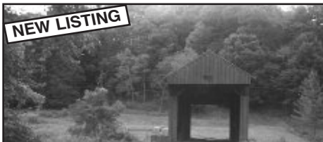
#77990 - This Property Is Ready To Go, Landscaped, New Septic, Electric. Beautiful View Of River And Historical Covered Bridge. Minutes From Stonewall Jackson Resort. Property Goes To The River With Private Surroundings. Call For Details.