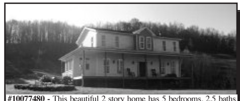
#10077480 - This beautiful 2 story home has 5 bedrooms, 2.5 baths and unique custom detail located on 11.55 acres of panoramic views from every room. Large living room with fireplace, custom plantation shutters throughout. This property is sub-dividable for other residence. there are 3 level acres with road frontage. This one of a kind charming home has a 38x40 garage with office for that small business/home business owner. CALL TODAY for details.