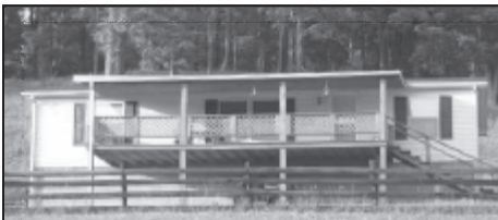
#55390 - Beautiful home and fenced yard with panoramic view, endless possibilities with an additional 30 acres available, small barn, garage. Just minutes from lakes and boating. This is a turn key home for the family that wants privacy and room. $129,900