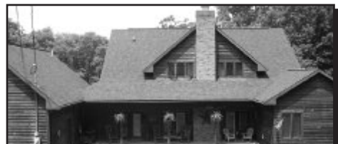
#63106 SAULS RUN - 4000 sq. ft. home on 6.5 acres! Home features 6 bedrooms and 4-1/2 baths. Property has another cabin on it as well as free gas! $424,900 . Call Joni!