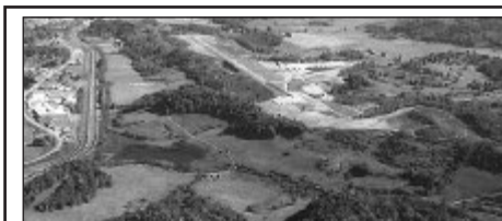
#69420 - $395,000 - RT. 33 BUCKHANNON, WV. Great investment property, located centrally in the state. We will sell, lease, lease purchase. Airport adjoins property. Great opportunity for large companies to come to area. Excavating and are also able to build, buildings to suite customers needs. Call today for this endless possibilities. there are several acres available, for development.