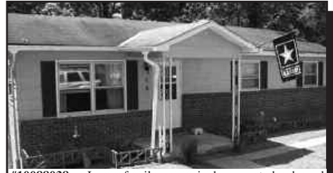
#10088038 - Large family room in basement, hardwood floors and large custom pool. 4 bedrooms and 1-1/2 baths. 1 acre lot.