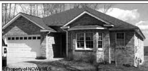
#10090791 - Here is your chance to purchase a great property with breath taking views. Overlooking a nine hole golf course and Buckhannon River. Hardwood floors, 2 stall attached garage and breakfast nook.