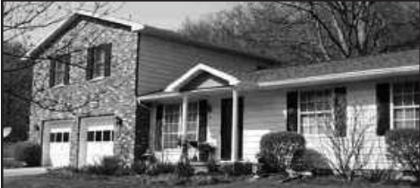
#10091399 - Very well kept home in great family neighborhood. 650 SF addition over garage is currently master suite but could be a wonderful family room. New tile flooring in kitchen. Much more.