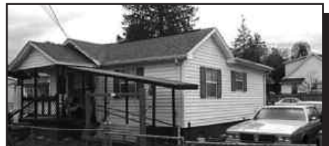
#10091251 - Great investment property. Wheel chair ramp and fenced yard. 2 bedrooms, 1 full bath. $69,900