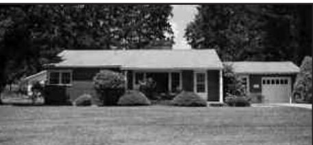
#10077242 - Quality brick home in highly desired neighborhood. Gorgeous refinished floors in living room, hallway and bedrooms; new ceramic tile in laundry and bathrooms; new laminate in kitchen, dining and family areas.