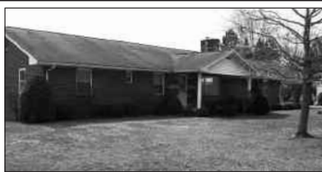
#10090408 - Brick ranch on the Brushy Fork Road offers over 2,000 square feet, 1-1/2 baths and 2 car carport on level lot.