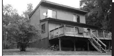
#10087155 - Free gas with this private & secluded 15 acres. Long private drive. Anxious sellers. Well & city water and whole house generator. $135,000.