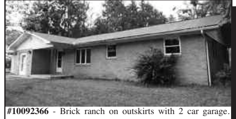
#10092366 - Brick ranch on outskirts with 2 car garage. Replacement windows and rewired. 1-1/2 acre lot with fenced back yard. 3 bedrooms, 1-1/2 baths. Hardwood, laminate and vinyl floors. Selling "as is".