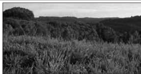
#10088252 - Great getaway for privacy on 60 acres of land. 15 minutes from Buckhannon. Existing cabin over 2 car garage. Could be converted to year round living.