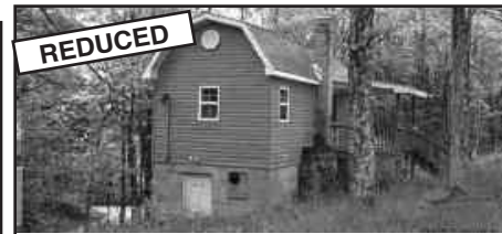
#10085398 - Attention outdoor lover! If you are looking for a gateway or camp with 12 acres fee simple, this might be the one for you. Basement, fireplace and chimney were part of an old building. Main floor is new with a nice size multi-purpose room and full bath. Vinyl sided and metal roof. $60,000