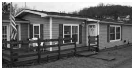
#10084559 - Great find with 1,800 SF and 3 bedrooms and 2 baths. Detached 2 car garage. Additional 2 bedroom, one bath rental home that rents for $500 a month. Paved driveway. Located in Weston.