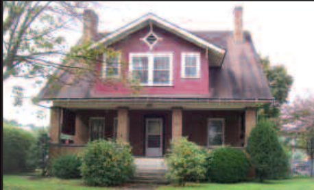
#82638: Excellent location along S. Kanawha Street! 3 BR, 1-1/2 baths, gas heat, wood & vinyl floors, family room, dining room, nice covered porch & detached garage. Large 0.75 acre lot! $225,000