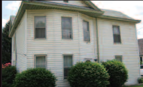
#91966: Great potential in this older 2 story home on S. Kanawha St. - Residential or Commercial use! 8 rooms, 1800 SF, 1-1/2 baths, wood & carpet floors, family room, gas heat & road frontage on S. Kanawha & Fayette St. $200,000