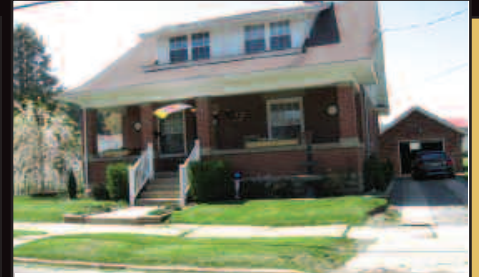
#91503: Beautiful well maintained brick home w/ many updates including a completely remodeled kitchen. 4 BR, 2 baths, 2 fireplaces, wood & carpet floors, oak trim, nice open basement, lrg covered porch, lrg rear deck, det garage, & privacy fence. $164,900