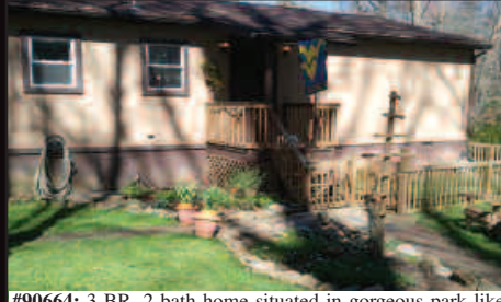
#90664: 3 BR, 2 bath home situated in gorgeous park like setting on the Buckhannon River! Gas & electric heat, central air, applianced kitchen, laundry area, city water, 2 storage buildings, carport w/ storage above. Wonderful for year round living or a superb camp!! $135,000