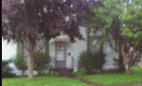
#87875: Adorable 1 story home in walking distance to WVWC!! 3 BR/1bath, recently redone wood floors, gas heat, new countertops in kitchen & bath/ & off street parking. $65,000