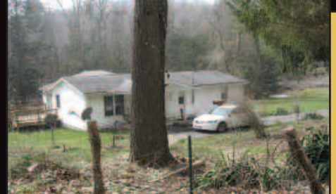
#90822: Nice home in Rock Cave on 1+ acre lot - 3 BR, 1 bath, beautiful wood floors, family rm, elec & propane heat, city water, garden space, 2 c garage, & along pretty stream. $124,900