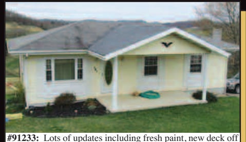
#91233: Lots of updates including fresh paint, new deck off kitchen, back deck cleaned & sealed, new storm door, carpet cleaned, & much more. 4 BR, 2 baths, family rm, appliances, finished basement, outside lighting, & excellent views. $149,900