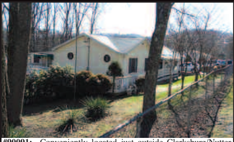
#90091: Conveniently located just outside Clarksburg/Nutter fort area & close to I-79! 2 BR (could easily be converted to 3), 2 1/2 baths, carpet & vinyl floors, gas heat, central air, deck, 2 screened porches, fenced yard, & finished basement w/kitchen, family rm, BR, & bath. Lots of storage.