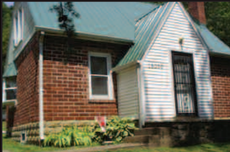
#87341: Totally restored, furnished home w/ 3 BR, 2 baths, walk in closets, beautiful HW floors, all appliances, gas log fireplace, pond, 2 springs, & some timber. $109,900