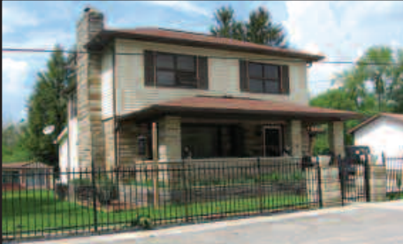
#92010: Very attractive stone & vinyl home in Coalton! 2 story w/4BR, 2-1/2 baths, wood floors, appliance kitchen, enclosed hot tub, stone walkway, large rooms & cabana in back yard. $159,000