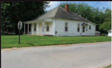
#91967: Great starter home or rental investment! 2BR, 1 bath, carpet & vinyl floors, FA gas heat, fireplace, laundry room & front covered porch. Located on large corner lot. $68,000