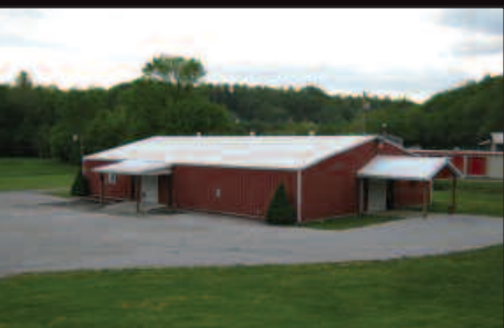
#91781: 5560 SF metal building on 2 acres only 1/2 mile from I-79! Excellent location. Many possibilities. $320,000