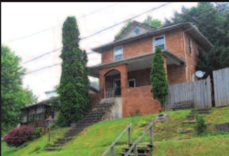
#88881: 2 story brick home in Gassaway- 3 BR, 1 1/2 baths, wood floors, FA gas heat, partial basement, & only 3 miles to 79! $65,000