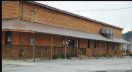
#83792: Excellent opportunity to start your own business! Located downtown Buckhannon! 3800 SF building w/ tons to offer! ALL equipment including U shaped bar w/ center island, booths, tables, chairs, barstools, TV's, 2 York heat/AC units, 10' waterfall in breezeway, Hinkle's glass light globes, ADA ramps, & so much more!! $500,000