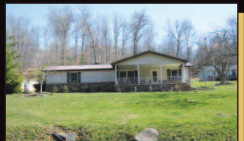
#90998: Spacious home close to town w/ a country atmosphere! 5 BR, 3 baths, gorgeous stone fireplace, 2 master suites, FA gas heat, central air, family rm, beautiful landscaping, patio, & hot tub. $245,000