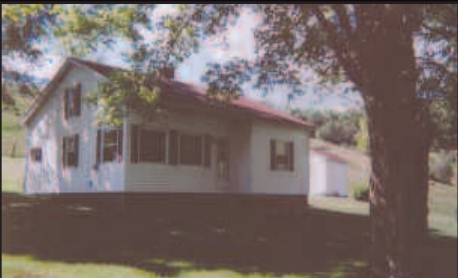
#48573: 1000 SF ranch on 37 Acres! 3 bedrooms, 1 bath, carpet & wood floors, dining room, laundry room, gas FA heat, barn & close to town! $260,000