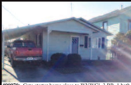
#90970: Cute starter home close to WVWC! 3 BR, 1 bath, NEW kitchen, windows, & hot water tank, like new appliances, walk in closet, landscaped & fenced yard, & concrete pad for outbuilding. $92,900