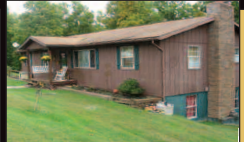
#88635: Nice ranch home w/ 3 BR, 2 baths, lrg kitchen & dining area, family rm, electric heat, fireplace, partial basement, & att 2 c garage. $159,000