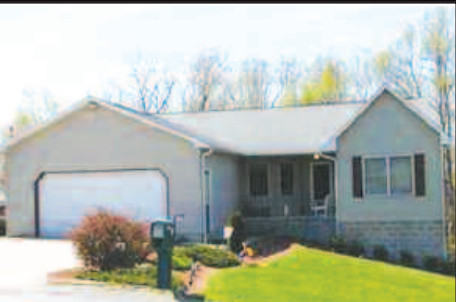
#91349: Lovely home in great neighborhood! 3 BR, 2 baths, wood & tile floors, pantry, fireplace, family rm, huge covered deck, 2 c garage, & on 1 acre. $189,900