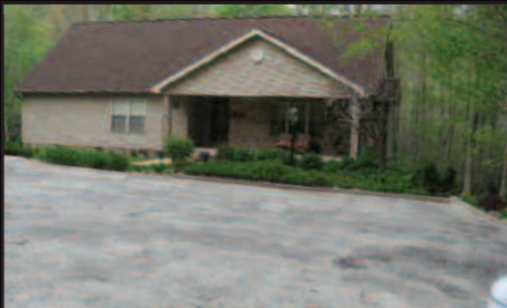
#80072: Above average ranch home on 5+ acres w/3 BR, 2 bath, appliances, garden space, outbuilding & 2 car garage w/ 2 BR apartment above. Nice landscaping & lots of extras. Secluded & Quiet!! $259,000