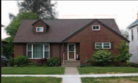
#91866: Beautiful brick home in great neighborhood! 3BR, ak, slate tile, & ceramic tile floors, new furnace, new windows, partially finished basement, lots of closet space, family room, dining room & detached garage. $179,900