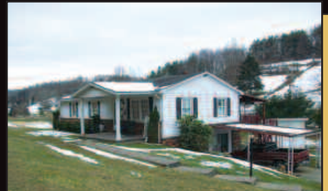
#90929: Lovely home in great neighborhood!! 3 BR, 2 1/2 baths, carpet & vinyl floors, central heat & air, also has elec. baseboard, & wood heat, appliance kitchen, dining rm, full basement, outbuilding, porches, & 12x24 garage on 2 acres.